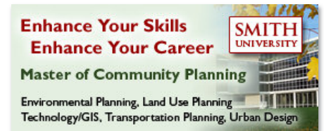
Sample Ad Banner

Ad banners on our Schools page are generously sized (280 x 116 pixels), so you can include specific information about the benefits of your program. We accept animated GIFs as well.